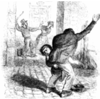
JJ Grandville's Les cent proverbes captioned "Qui aime bien châtie bien" ( Who loves well, punishes well) circa 1835.

With the advent of recent Brain-Body research the field of psychology and human behaviour is undergoing a major change in understanding the dynamics of conscious choice and the power of instinctual reactivity. Leading edge scientists and clinicians are exploring the role of the individual's experience of choice. Through didactic presentations, individual and small group interactions, we will explore the roles of maintaining choice in highly intense experiences. This work addresses the resourcing of both clinicians and clients in a psycho-educational ongoing process. Participants will leave with very simple yet effective Mind-Body exercises that will enhance centeredness, grounding and containment and interventions that will help promote resiliency and change with clients.